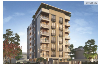
ROYAL GRACIA, Mahaveer Nagar | RERA No. RAJ/P/2022/1917