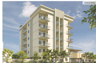
ROYAL EMINENCE, Tilak Nagar | RERA No. RAJ/P/2020/1352