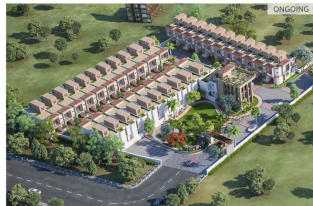
ROYAL EXOTICA, Gandhi Path | RERA No. RAJ/P/2019/1120