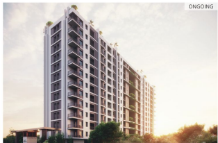
ROYAL GRAVITAZ, Gandhi Path | RERA No. RAJ/P/2020/1339