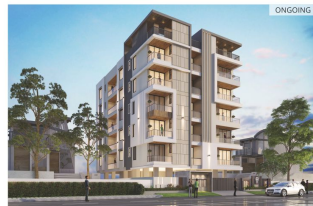
JANKI ROYALE, Bapu Nagar | RAJ-RERA-APP-P-2022-4598