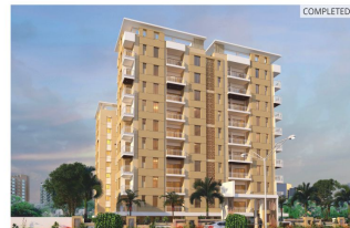
ROYAL REGALIA, Gandhi Path | RERA No. RAJ/P/2017/152