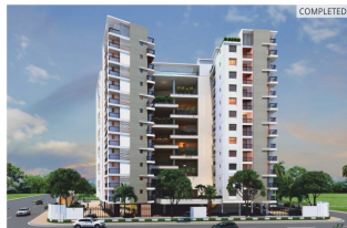
ROYAL ESSENCE, Gandhi Path