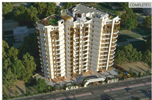
ROYAL TATVAM, Patrakar Colony